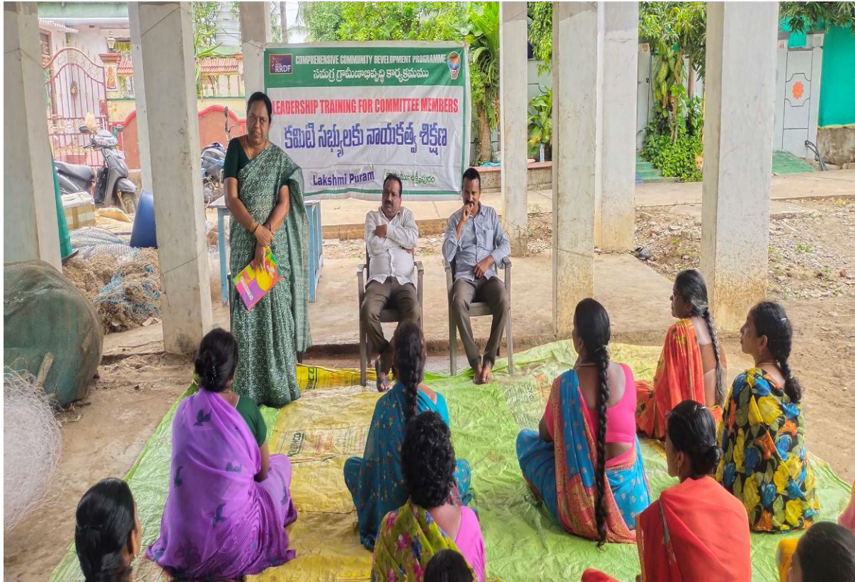
Leadership Training Camp for Committee Members