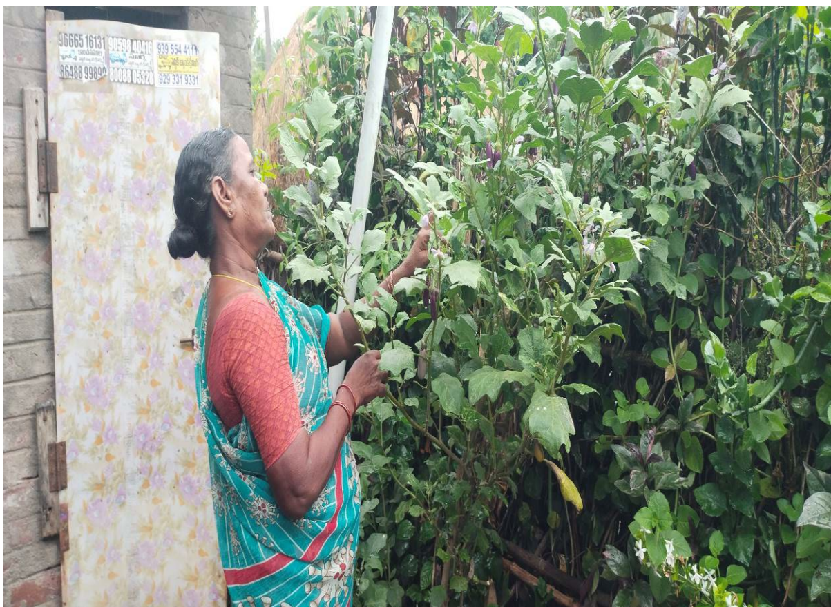
Taking care of Fruit Plants