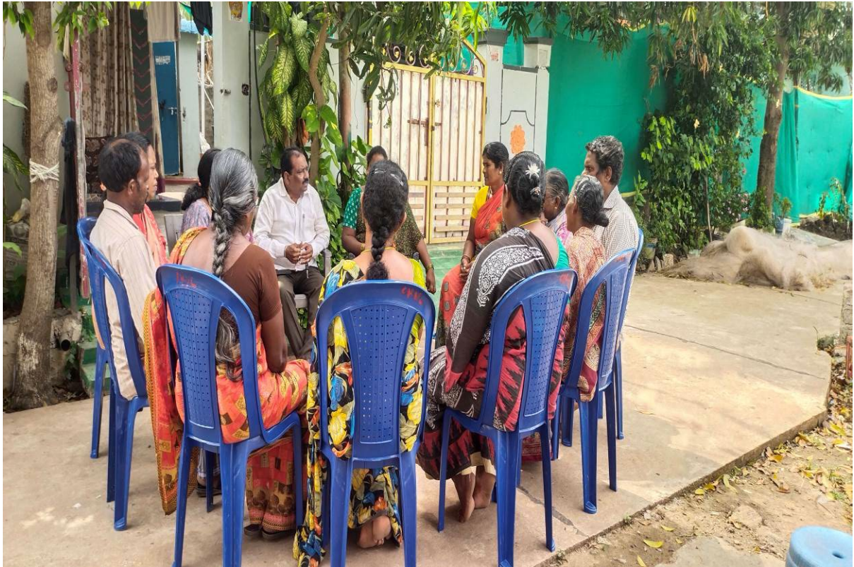
Monthly Meeting of VDS Committee Members