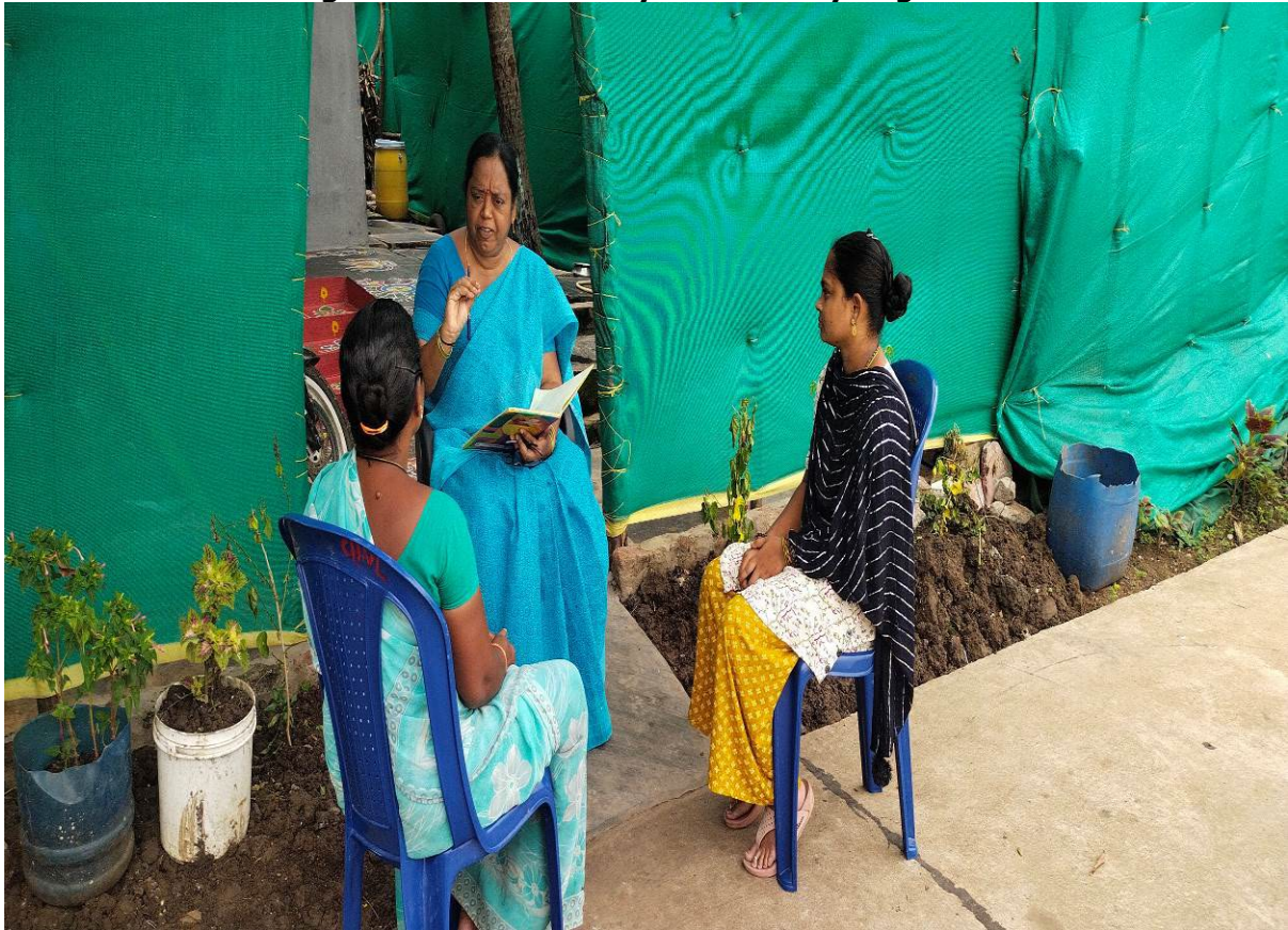
Regular House visits by Community Organiser